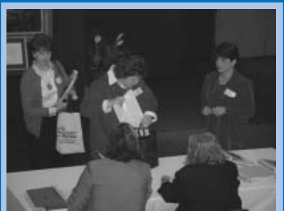
Guidance counselors sign in at the registration table for the workshop which was held in Baton Rouge at the Pennington Biomedical Center.

financial aid available for higher education in Louisiana.