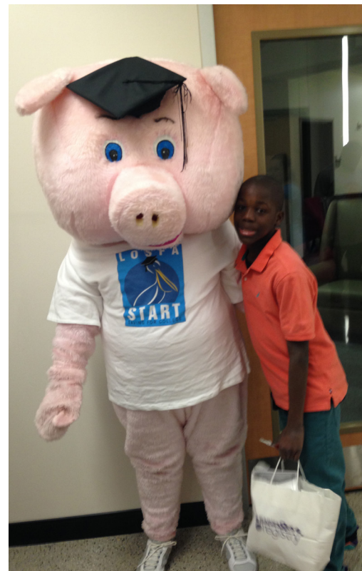
Earl E. START, mascot for the Louisiana START Saving Program, made an appearance at the Woman’s Hospital baby Grand event on May 2.