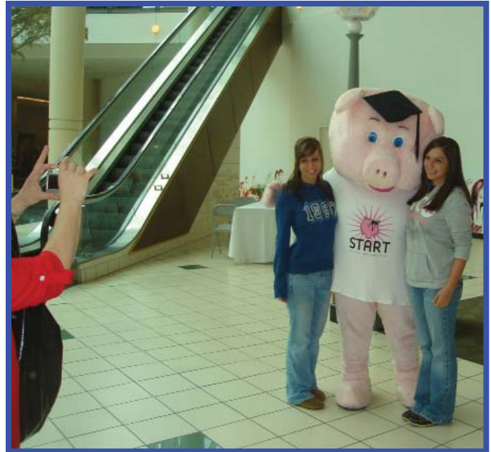
Everybody loves a spokes-pig! Earl E. Start poses with fans at the Kids Healthy Fun Fest.