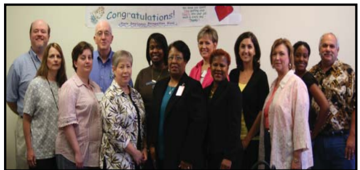
LOSFA staff members and representatives from Delgado Community College took part in Delgado Day.