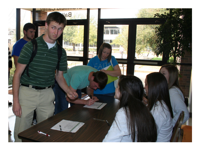
College Goal Sunday.

SOWELA Technical Community College Arts and Humanities Bldg. First Floor Multi-Purpose Room Lake Charles