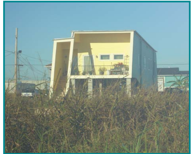
This home was constructed by a project sponsored by actor Brad Pitt.