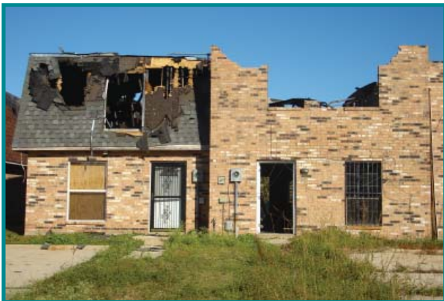
This home, one of countless others damaged by Hurricane Katrina, remains in ruins three years after the storm.

Issues that hamper school enrollment of homeless students, such as residency requirements, immunization records, transfer/school records, birth certificates, free/reduced lunch, school fees and guardianship are addressed under Louisiana Law and RS: 17:238, Board of Elementary and Secondary Policies.