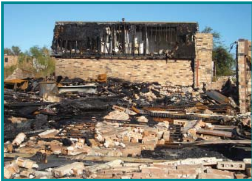
This wrecked home remains standing in New Orleans, three years after Hurricane Katrina.

After addressing the entire conference population we were advised that there is a Homeless Liaison Contact person for homeless students in every parish. In order to locate and/or contact them simply go to www.louisianaschools.net/ldc/uploads/11009.doc .