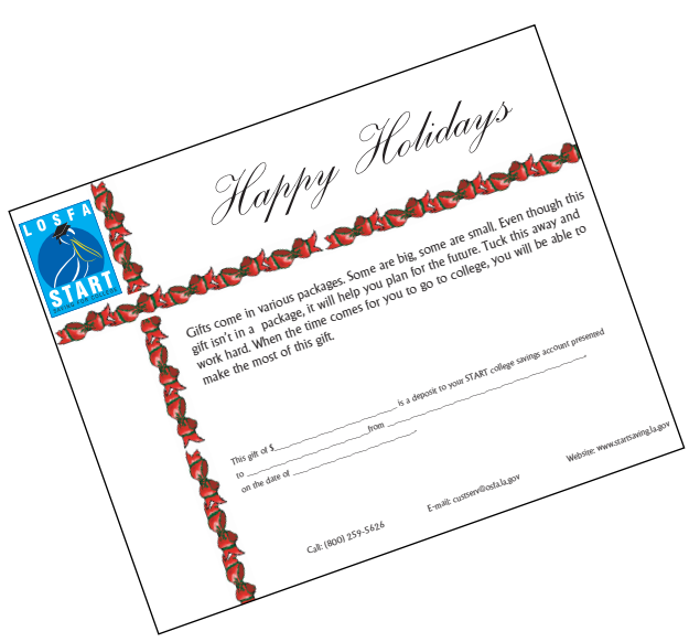
Printable gift cards are also available with Christmas, Hanukkah and Kwanzaa themes.

Deposits will also be accepted in person in the Mobile/ Manchac Room on the first floor of the Galvez Building in downtown Baton Rouge at 602 North Fifth Street from 8:30 a.m. until 3:00 p.m. Wednesday, December 26 through Friday, December 28. Parking is available in the Galvez Parking Garage on North Street and parking can be validated by the Galvez Building Security guard on duty. For more information, contact the Office of Student Financial Assistance toll-free at 1-800-259-5626.