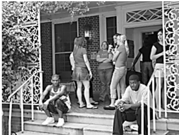
Left: Trailblazers mingle on the steps at Northwestern State University in Natchitoches, La. Camp registration sign-in and dorm assignments give campers their first opportunity to meet with peers from across the state and make new friends.

When the Trailblazers return to their high schools in the fall, they are well equipped to share their knowledge and expertise with fellow students, under the supervision of guidance counselors.