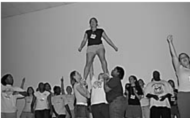
Above: Trailblazers at Southeastern Louisiana University stay on top of the learning curve and have fun at the same time.