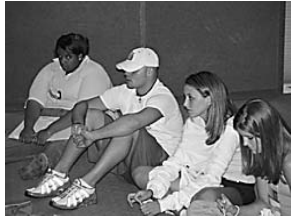
Above: Trailblazers at Northwestern State University contemplate their strategy while waiting for their chance to perform as teammates in camp learning activities.