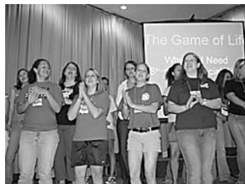
Above: Campers at Northwestern State University play a competitive game of Life, in keeping with this year's Trailblazer Camp theme: "Life: Get In The Game."