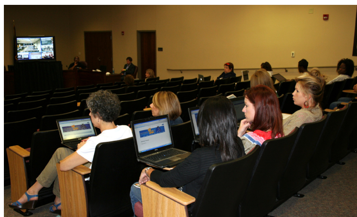
A group of Professional School Counselors gathered at Baton Rouge Community College to learn more about the Louisiana Connect portal from the ConnectEDU team.