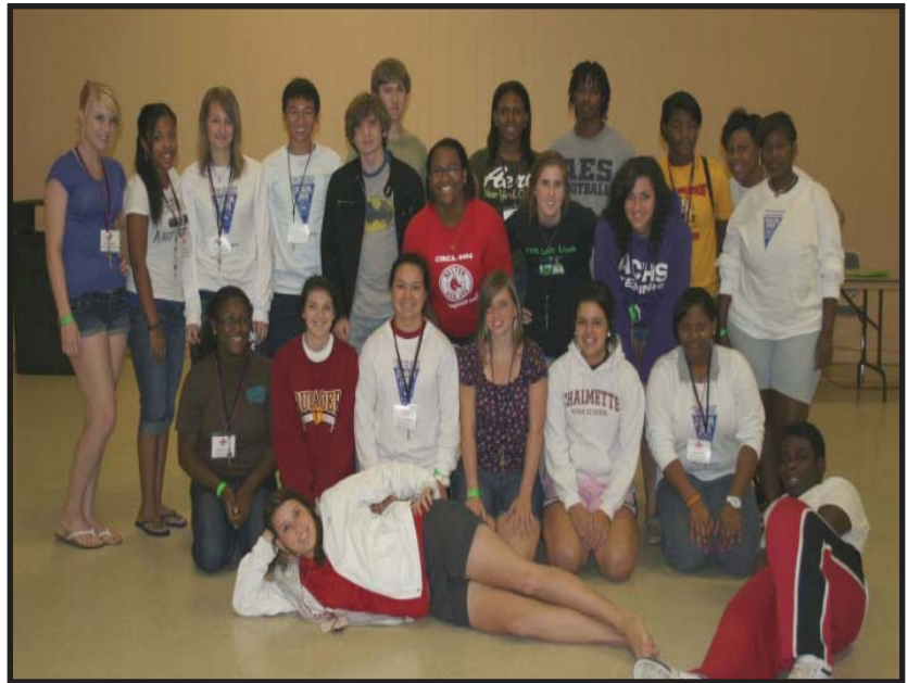
Congratulations to the Nicholls Krewe of Vulcan! Their YouTube video had the most views (173) of the eight 2011 Trailblazer videos over the past month. As the winning krewe, their group photo will be posted on the LOSFA Web site for the remainder of the year.

For more information, contact the Louisiana Office of Student Financial Assistance: