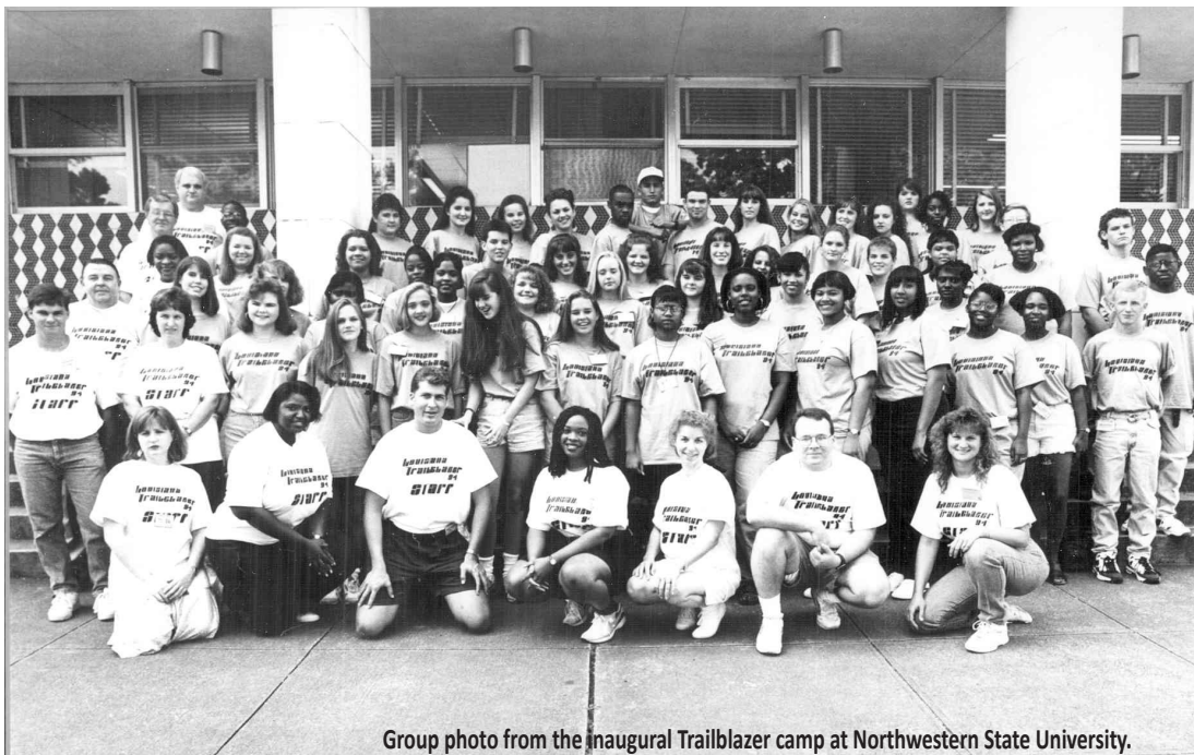
Group photo from the inaugural Trailblazer camp at Northwestern State University.

The camps were not all business. Students were treated to nightly entertainment, including a dance and karaoke event and visits to the campus recreation centers for basketball, volleyball, and swimming.