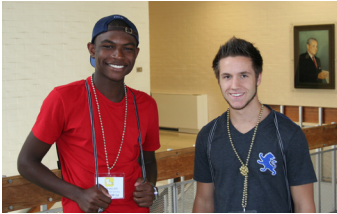
Trailblazer Camp 2012 - Page 2