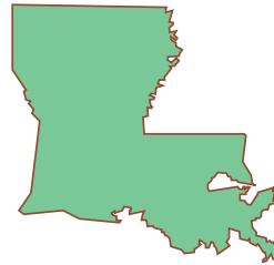
Legislative Acts from the 2012 General Session - Page 10